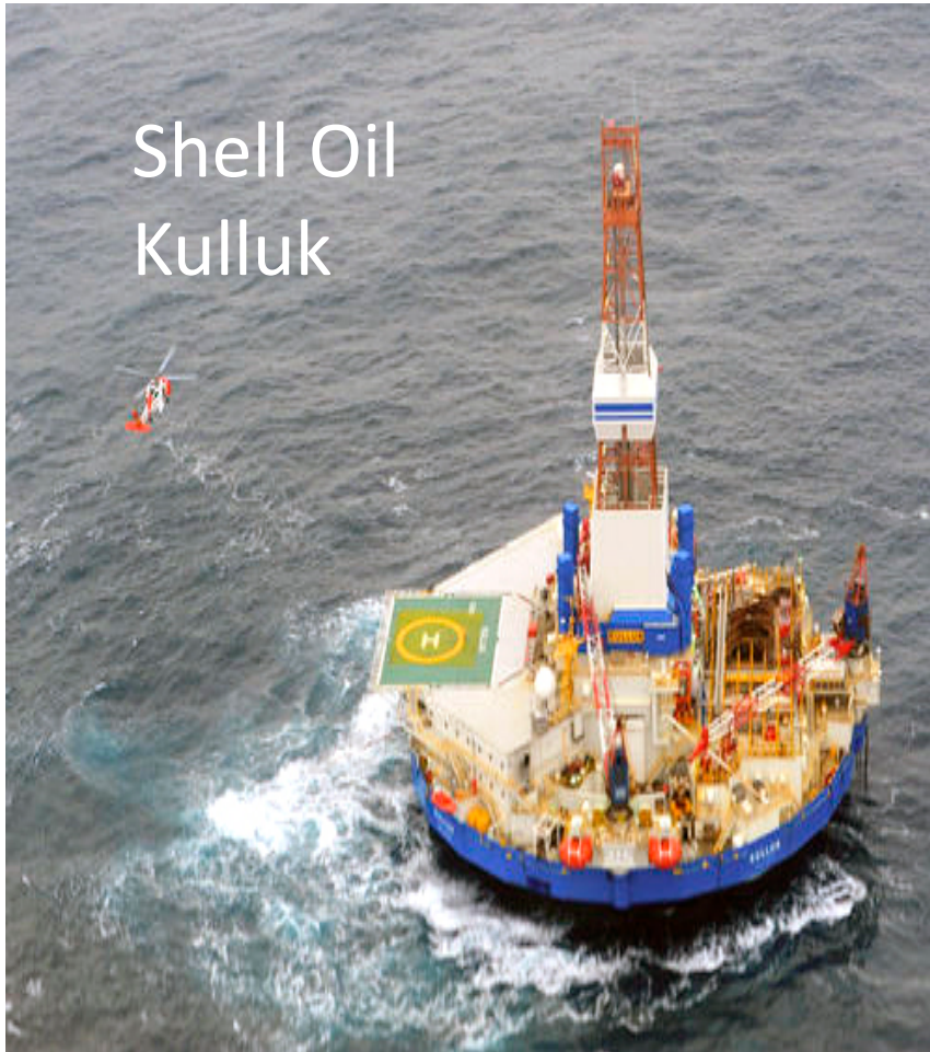
Shell Oil Kulluk