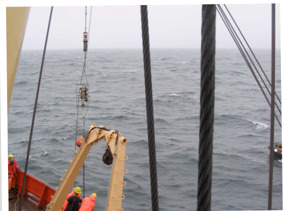
Observations from Diverse Platforms