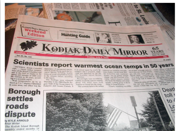
Public Outreach and Education